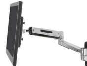
LX Sit-Stand Wall Mount LCD Arm