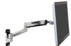
LX HD Sit-Stand Wall Mount LCD Arm