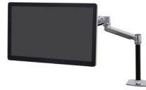
LX HD Sit-Stand Desk Mount LCD Arm