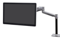
LX Sit-Stand Desk Mount LCD Arm